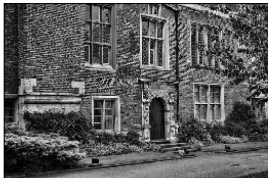
King's Manor, York

Speakers will be asked to submit for publication a written version of their paper not exceeding 5000 words, within one month following the conference – although they are encouraged to submit their manuscript prior to the conference. The Society reserves the right not to publish the manuscript of any paper not received by 31 May 2016.